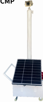
Physical Assembly Effect